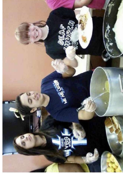
Deaf Youth Service Project

Above all, we earnestly solicit your prayers that the Lord of the church will continue to bless the work of the International Lutheran Deaf Association to the glory of His Name.