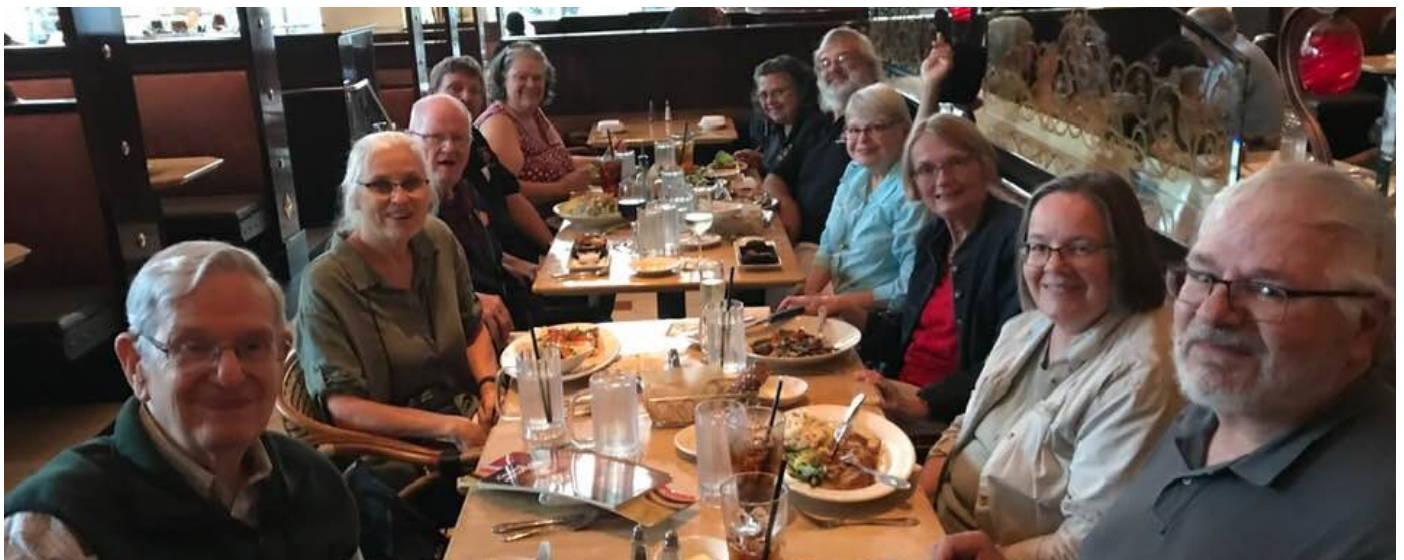
ILDA members enjoying a meal at the DSA Conference in Seattle, WA in September.