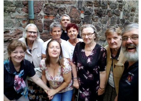
The Latvia group