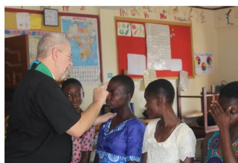
14 Deaf Students receive the sign of the Cross at their Baptisms