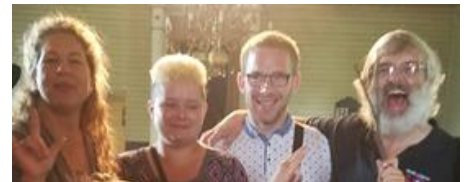
The lady on the left from Latvia is in training to become a deaconess.