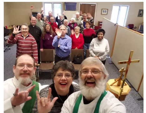
The Jesus Signs workshop/Sunday morning attenders from Alpha, Rochester, NY.