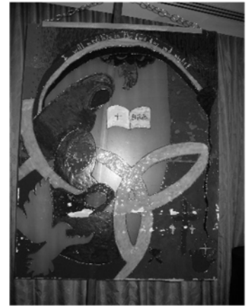
4 th Place Concordia LC Kirkwood, MO