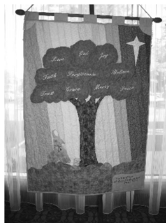
2 nd Place Our Savior Deaf LC Madison, WI