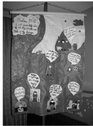
3 rd Place Peace Deaf LC Indianapolis, IN