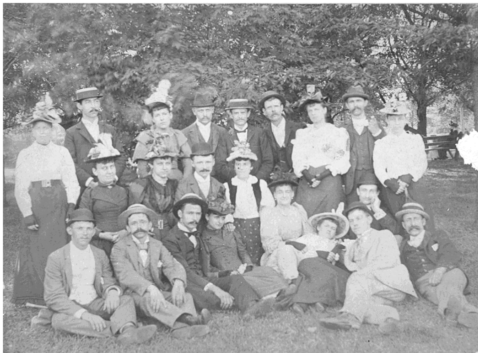
Members of Deaf Church c. 1894-1895 at Lincoln Park [Chicago]

Inside This Issue: New Workers in Ghana Macau Revisited