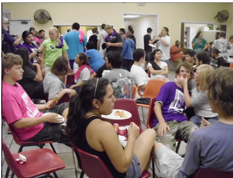
High School students enjoying the snacks after learning about how we should reflect God's love to the world.