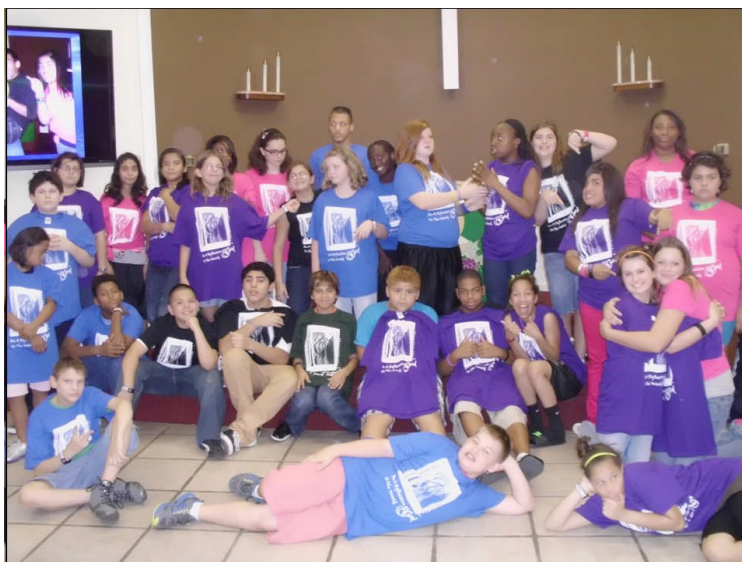
Some of the Middle School students showing off their new t-shirts given to them by JDYM. The shirts say, "Be a reflection of God to the World." 2 Corinthians 3:18

Jesus Deaf Youth Ministry started with one boy several years ago. That one boy started inviting his friends, and by the end of the first year, 48 deaf teenagers had attended. By the end of the second year, 180 deaf students had attended, and it has never slowed down! The