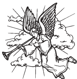
His name shall be called... Prince of Peace. Isaiah 9:6