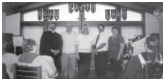
2004-2006 CR/ILDA Officers