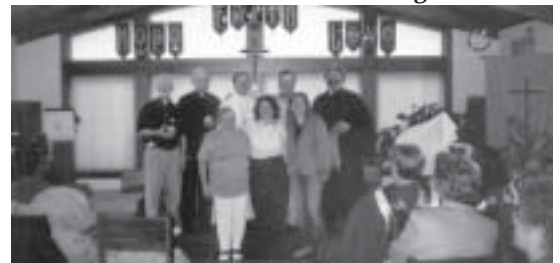
Pastors & 2004 CR/ILDA Hosts

Ask your Pastor *Holy Communion *Anoint with Oil Luke 2:25-32 “Simeon meets Jesus:”