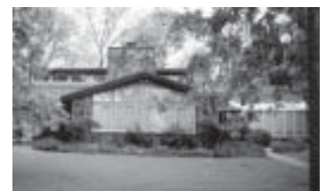
Our Savior Deaf Lutheran Church, Madison, WI