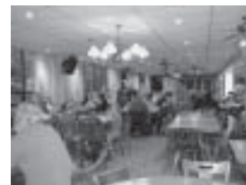
Cafeteria of Western PA School for the deaf.