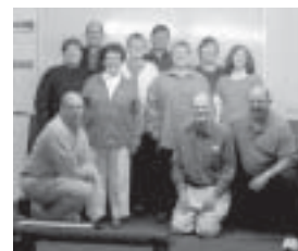
Christ Deaf Lutheran Church, Cleveland, OH.