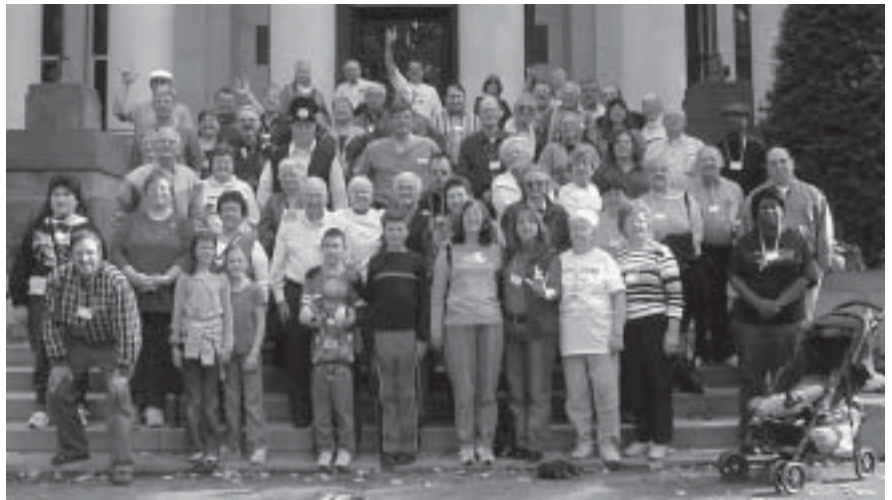
Group shot of GLRC 2003 attendees.