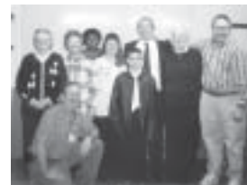
Alpha Lutheran Church/Deaf, Rochester, NY.