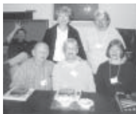
Members of St. Mark Lutheran Church/Deaf, New York City.