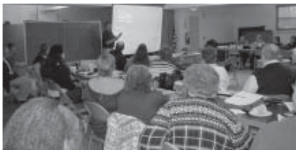
Workshops and meetings.