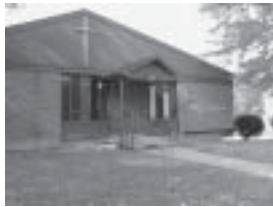
Trinity Lutheran Church/Deaf.

Theme: "Reaching Young Deaf, with Good News of Jesus."