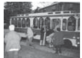
Scenic Pittsburgh Trolley Tours.