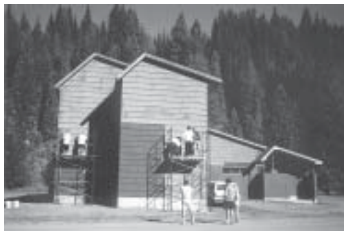
Mill Neck students on scaffolding paint a dormitory at the Shoshone Base Camp for their Servanthood Project.

on their disabilities, but their abilities. Through their hard work, students learn responsibility, selflessness and the importance of helping others. Past projects included trips to Phoenix, Arizona, where students worked on an Indian reservation; Kingston, Jamaica, where students helped to build a new school; and New York City, where Servanthood team members worked at soup kitchens and shelters.