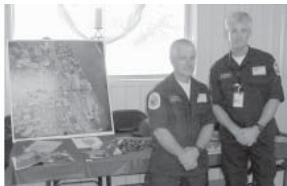
Special Guest... Texas Task Force-1 firemens.