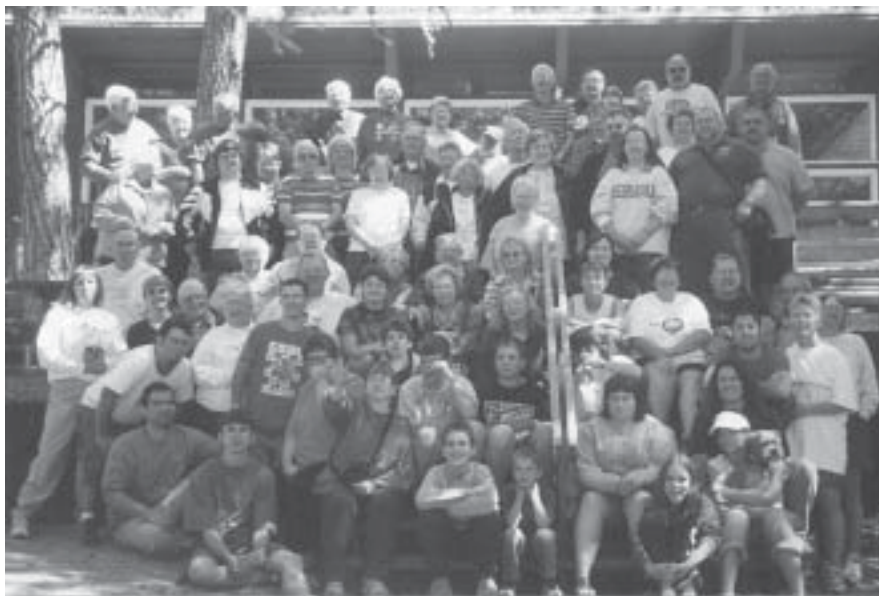
Above: Group shot of folks attending the Northwest Region ILDA Camp!