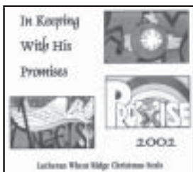
Wheat Ridge Christmas 2002 Seal. www.wheatridge.org

Remember to send to the D/L editor your church's newsletters!