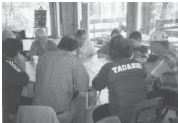
Right: Group playing color Dominos.