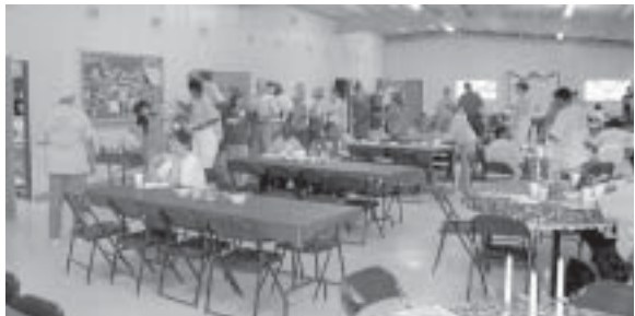
Left & below: Christians who has attended the DDLC conference.