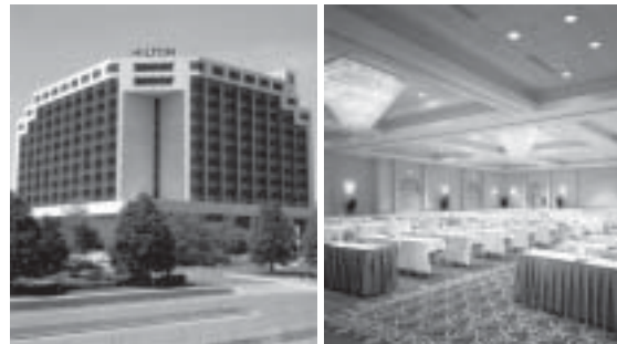
Hilton Minneapolis/ St. Paul Airport