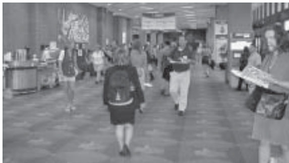
The lobby on Tuesday morning before the real crowd has arrived.